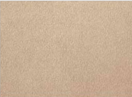
Corn Silk Beige 'Alcantra/Dropmag' cloth upholstery XU