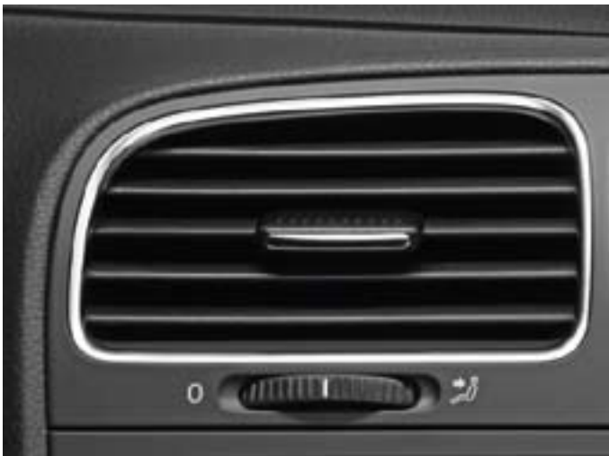
Chrome trim rings on the air vents further contribute to the elegant design.