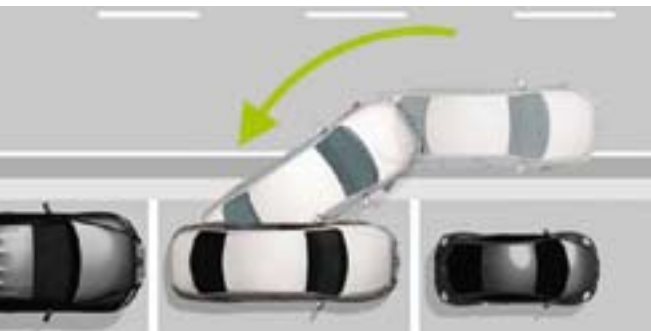
Park Assist: The New Golf takes the effort out of parking. With the unique Park Assist system, which self steers into parking spaces, as well as an integrated rear camera, you can sit back while the car does the hard work.

The New Golf exudes a sense of safety and well being, verified by its 5-star NCAP safety rating. In the event of an accident passengers can rely on the comprehensive airbag system. The New Golf includes airbags for the driver and front passenger (with deactivation function