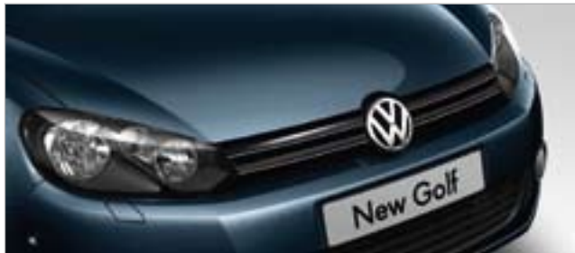
Blue Graphite Pearl Effect Paint W9