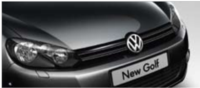
Deep Black Pearl Effect Paint 2T