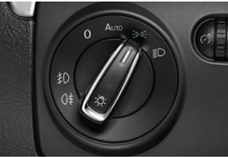
Ergonomic chrome-look rotary light switches combine functionality with attractive design.