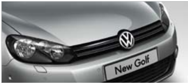
Reflex Silver Metallic Paint 8E