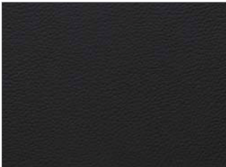
Titanium Black 'Vienna' leather upholstery TW