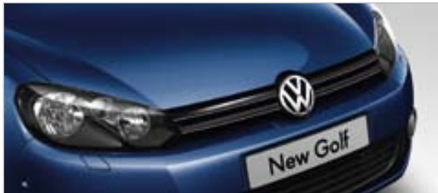
Shadow Blue Metallic Paint P6