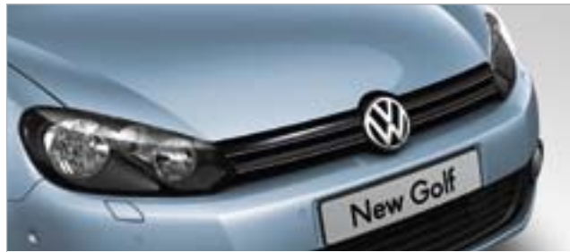
Shark Blue Metallic Paint 5R