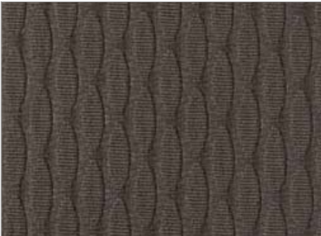
Latte Macchiato 'Roxy' cloth upholstery BA