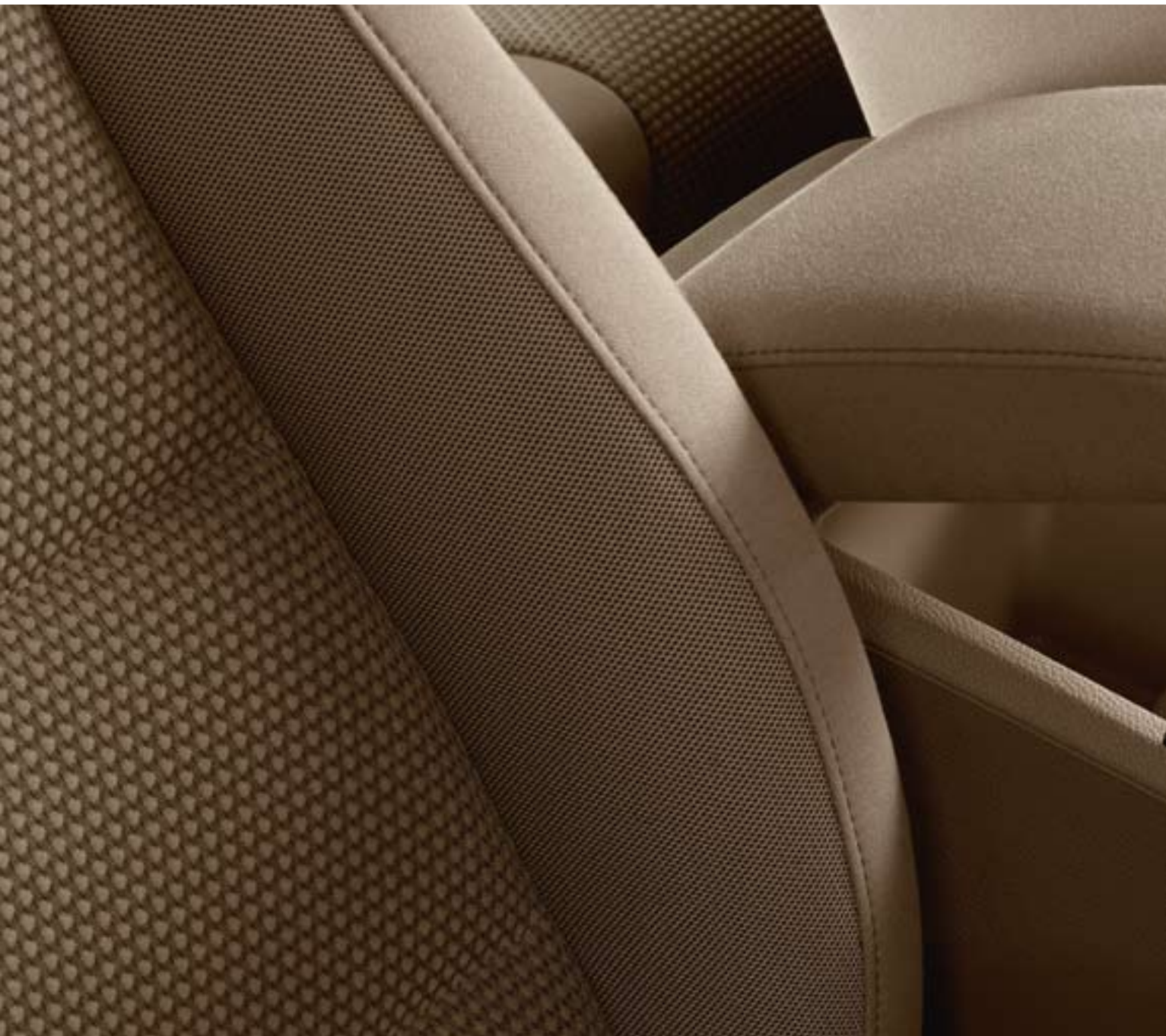
Adjustable lumbar support helps to keep your back in a comfortable sitting position on long journeys.