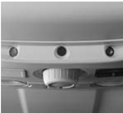
The anti-theft warning system has an interior monitoring function in the interior light module on the head lining. An electronic immobiliser and a tow-away warning are included.

for the front passenger airbag), a knee airbag at the front on the driver's side, and a curtain airbag system with side airbags for the driver and front passenger. The airbags are triggered by high-response crash sensors: if they register a collision, the airbag control unit activates