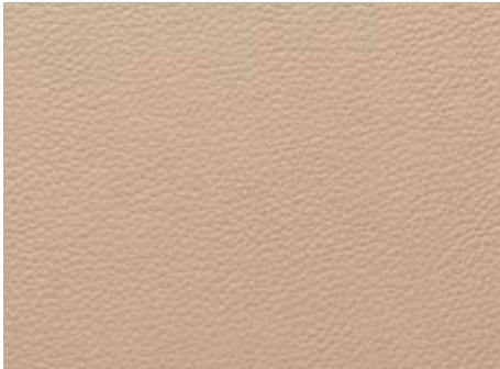
Corn Silk Beige 'Vienna' leather upholstery YY

Leather options available on Comfortline and Highline models only.