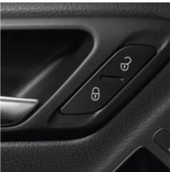
Central locking with an interior locking function can be activated at the touch of a button.