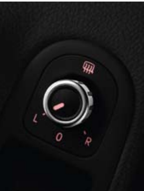
The switches have red 'night' design making it easier to operate them at twilight and in the dark.