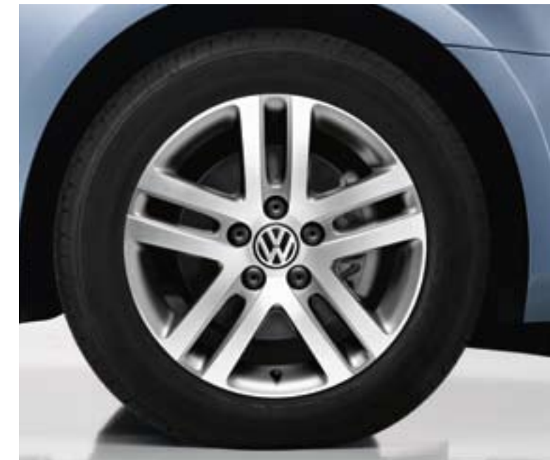
The 6½J X 16 'Atlanta' alloy wheel with tyre size 205/55 R16 W provides a dynamic appearance. Standard on the Comfortline model.