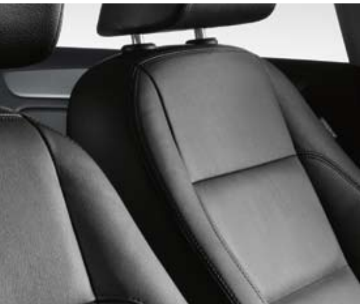
'Vienna' leather trim features on the centre and side seat panels. Colours to choose from are: Corn Silk Beige, Truffle and Titanium Black.