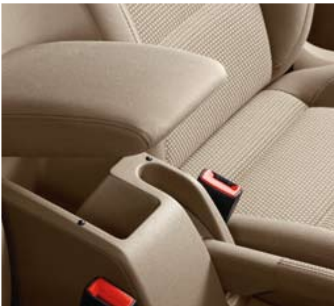
The front centre armrest has a roomy storage box, essential for storing important items and keeping them within easy reach.