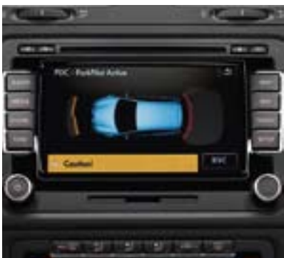
'ParkPilot' gives sound and visual signals to warn of obstacles at the front and rear when parking. With this optional driver assistance feature the audio signals become more rapid as obstacles are approached.

Fog, dust or heavy rain: the fog lights including turning lights improve illumination of the road in conditions of poor visibility. Xenon headlights with a wipe/wash feature is available as an option.