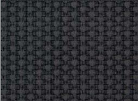
Titanium Black 'Merlin/Scout' cloth upholstery FW