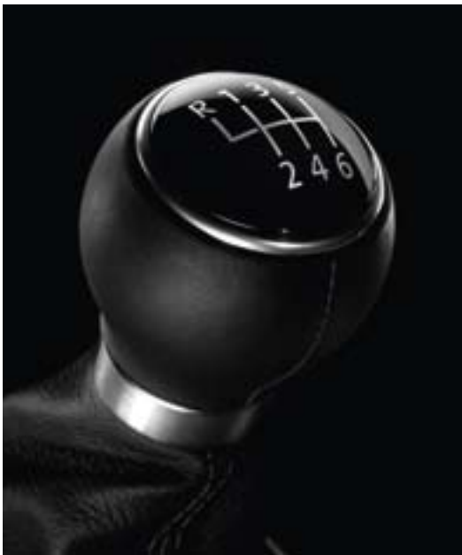
The 6-speed manual gearbox has precise, short gearshift travel and a smooth gear change so that you stay in the right engine speed range at all times.

consumption. Twin-charger with double charging offered only by Volkswagen is used in the New Golf range. The new TDI diesel engine with common rail technology is a highly