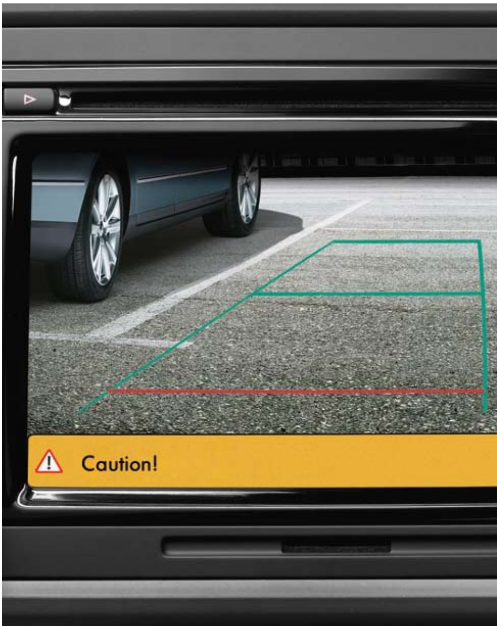
The optional 'Rear Assist' rear-view camera provides a clear image of what is behind the vehicle, as well as virtual markings to assist with reverse manoeuvring.

a gas generator which fills the airbags within 30 to 40 milliseconds. In this way, the risk of injury is significantly reduced, particularly in the neck area.