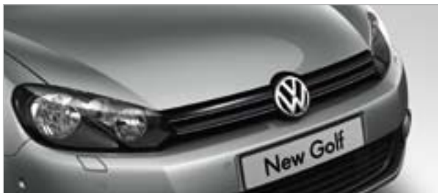
United Grey Metallic Paint X6