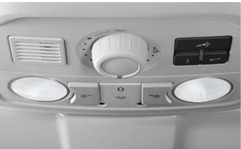
Two reading lights at both front and rear with chrome surrounds, add a touch of style to the Comfortline and Highline models.

leather-covered multifunction steering-wheel enable a radio and multifunction display to be operated with ease. The steering-column has reach and height adjustment so that the position of the steering-wheel can be set individually.