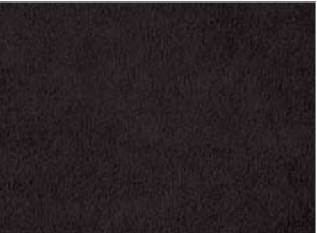
Titanium Black 'Alcantra/Dropmag' cloth upholstery XT