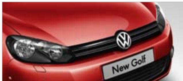
Amaryllis Red Metallic Paint 1U