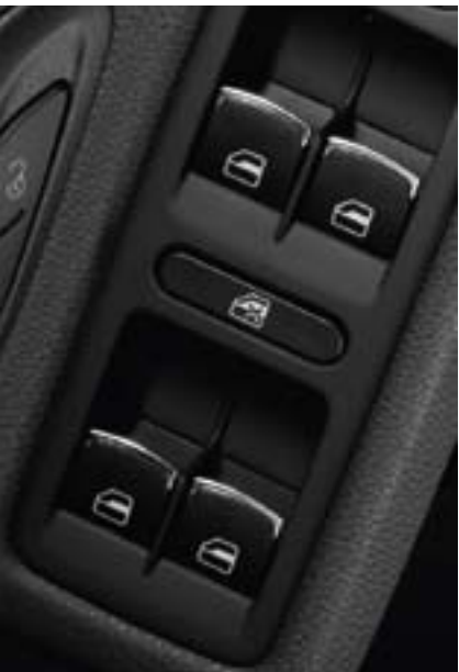
Front electric windows are standard on the Trendline models and electric windows at front and rear are standard on all Comfortline and Highline models. Chrome finishing (pictured here) is standard on Highline models.