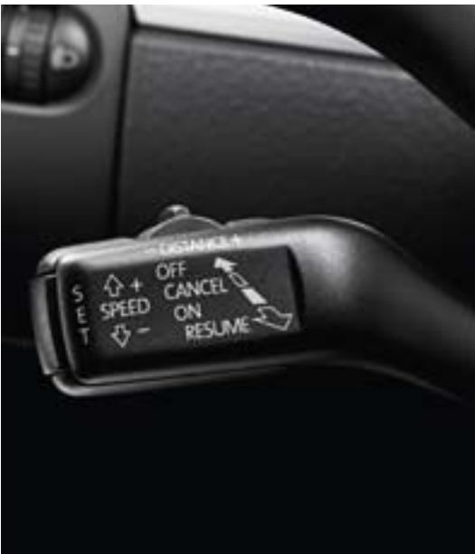
From as low as 30km/h cruise control maintains the speed at your selected level, contributing to relaxed driving, particularly on long journeys.