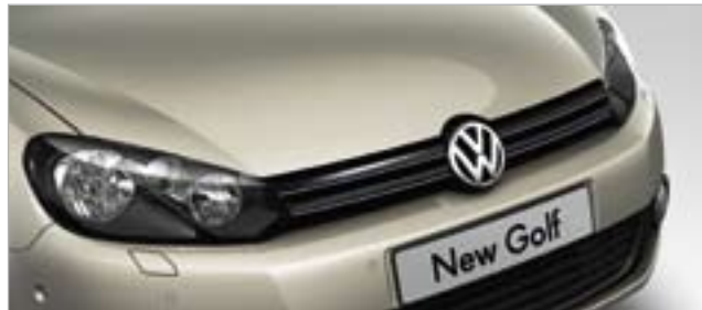
Silver Leaf Metallic Paint 7B