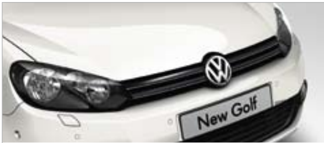
Candy White Solid Paint B4