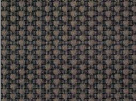
Latte Macchiato 'Merlin/Scout' cloth upholstery FX