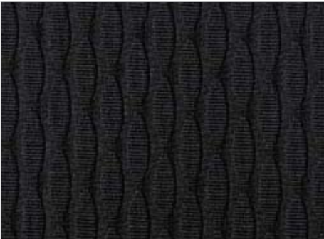
Titanium Black 'Roxy' cloth upholstery BB