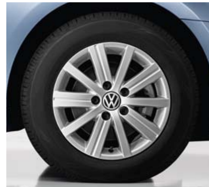
The 6J X 15 'Wellington' alloy wheel with size 195/65 R15 tyre highlights the reliability of the New Golf. Standard on the Trendline models.