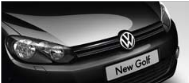
Black Solid Paint A1